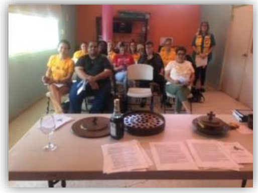
Getting ready for Sunday worship with the Unitarian Universalist congregation of Puerto Rico. This small but determined group is lay led, meeting as often as they can in a library on the outskirts of San Juan.