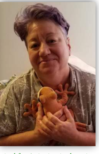
The sound of the coqui (a small tropical frog) singing in the rain forest has always symbolized joy for me. After my adventure with the mountain mud during our trip, my sisters gifted me with a stuffed coqui who sings that song. Now, when I hear the sound, I am filled with a knowing that I am surrounded by the love and support of my sisters! #LotoDeLodo (Lotus of the Mud)