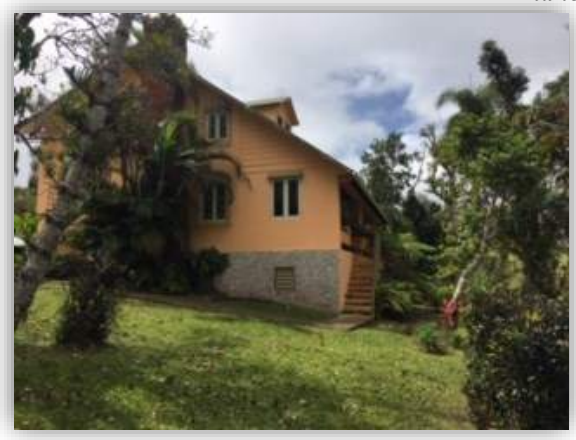
(Continued on page 6)