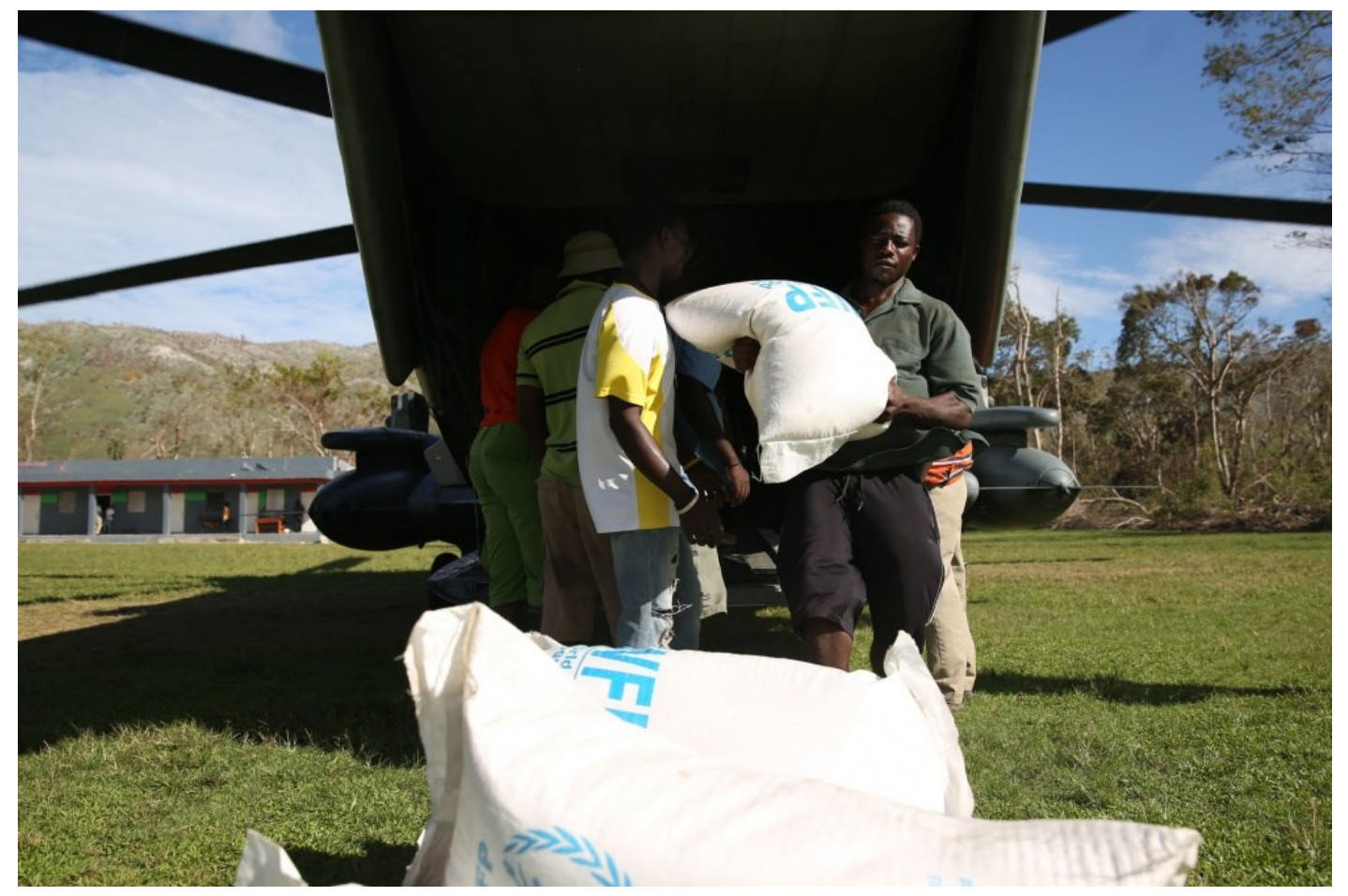
A Haitian man helps unload rice from the World Food Programme off of a CH-53 Super Stallion in Plaisance-du-Sud, Haiti, Oct 18, 2016.

Haiti will need much more time to recover. Who will be their support through the long days?