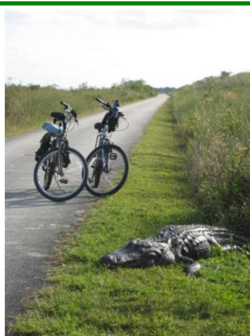
This dUUde had too many s'mores

The dUUdes survived the first night tucked away snugly in their tents as ferocious wild beasts roamed the campground feasting on the bits of leftover food purposefully left out as bait. The dUUdes awoke to a crisp Sunday morning and focused immediately on gorging themselves with unheard of amounts of bacon, cereal and blueberry pancakes before hiking the Hammock trails of the park. The rest of the day was spent playing on the playground, preparing for the evening bonfire (hey... it takes a LOT of wood to make a fire that big!), biking, eating, napping and just hanging out doing more of nothing. dUUdes are good at that.