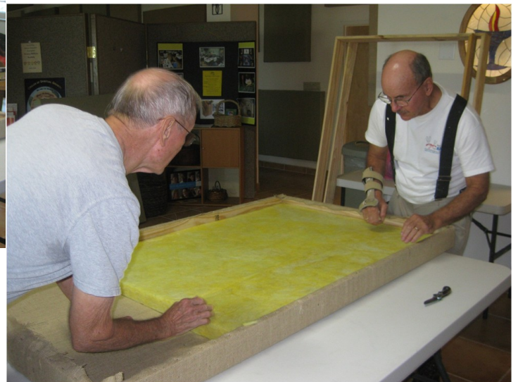
Next, the frame is fitted with a special type of fiberglass designed to absorb sound. You might notice that the fiberglass does not completely fill the frame – there is a bit of an air-space between the fiberglass and the wall which helps absorb the echoes.