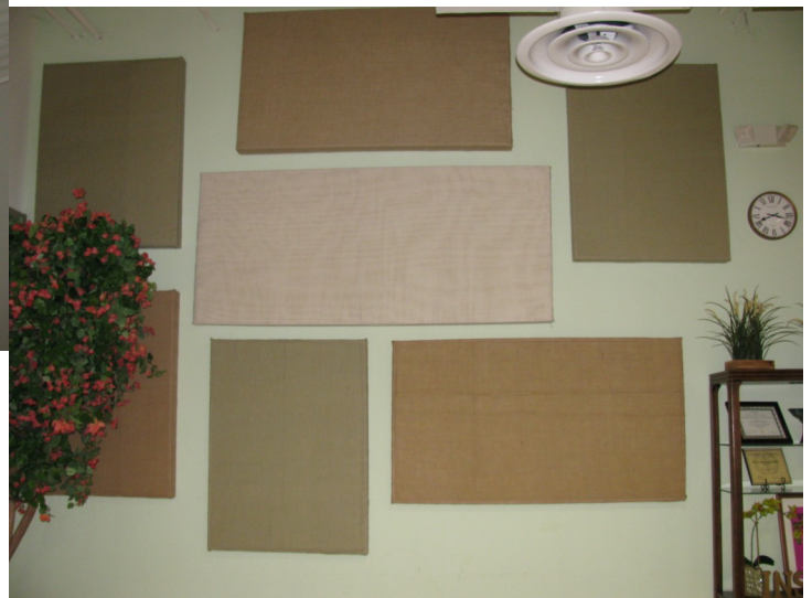
And to the right, you see a section of a completed wall.