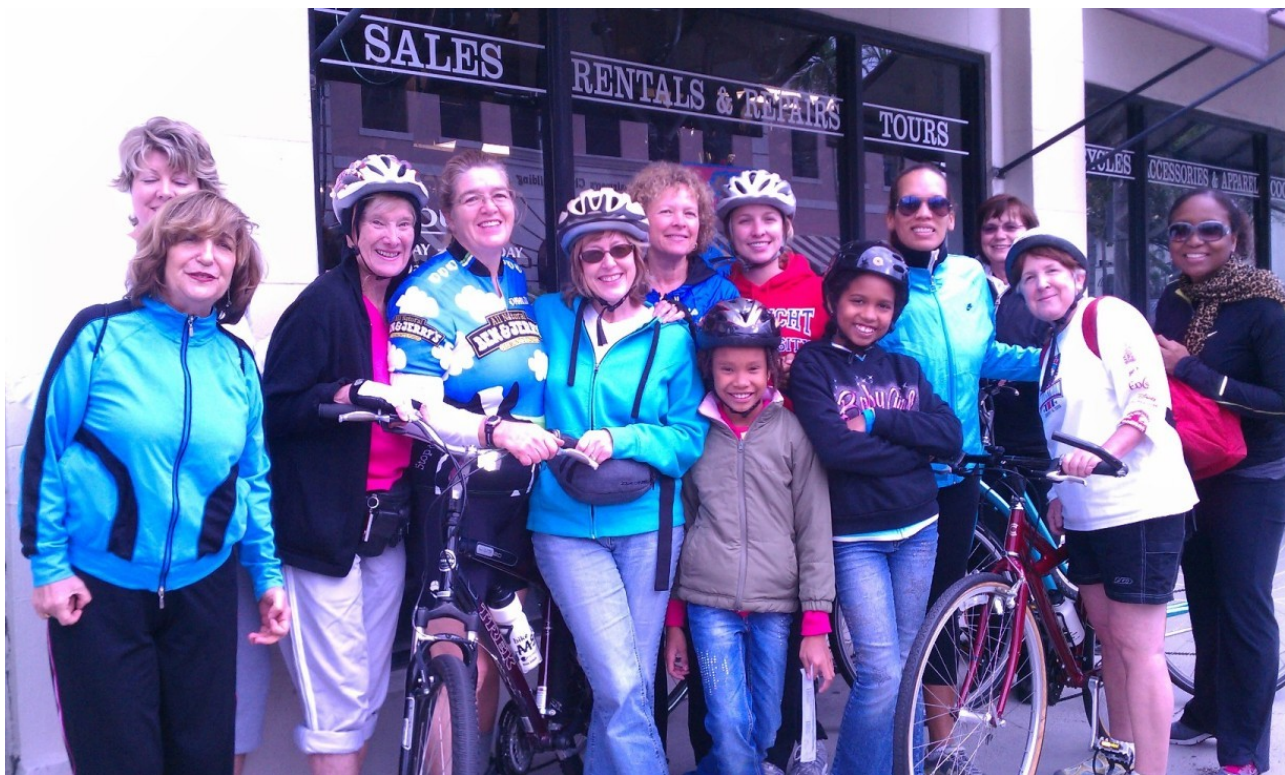
Full Moon Daughters get ready to saddle up their bikes and head off for a morning ride last month on the historic Palm Beach trail. The trip would take them past the mansions of the rich and famous, the magnificent Breakers hotel and along the ocean.