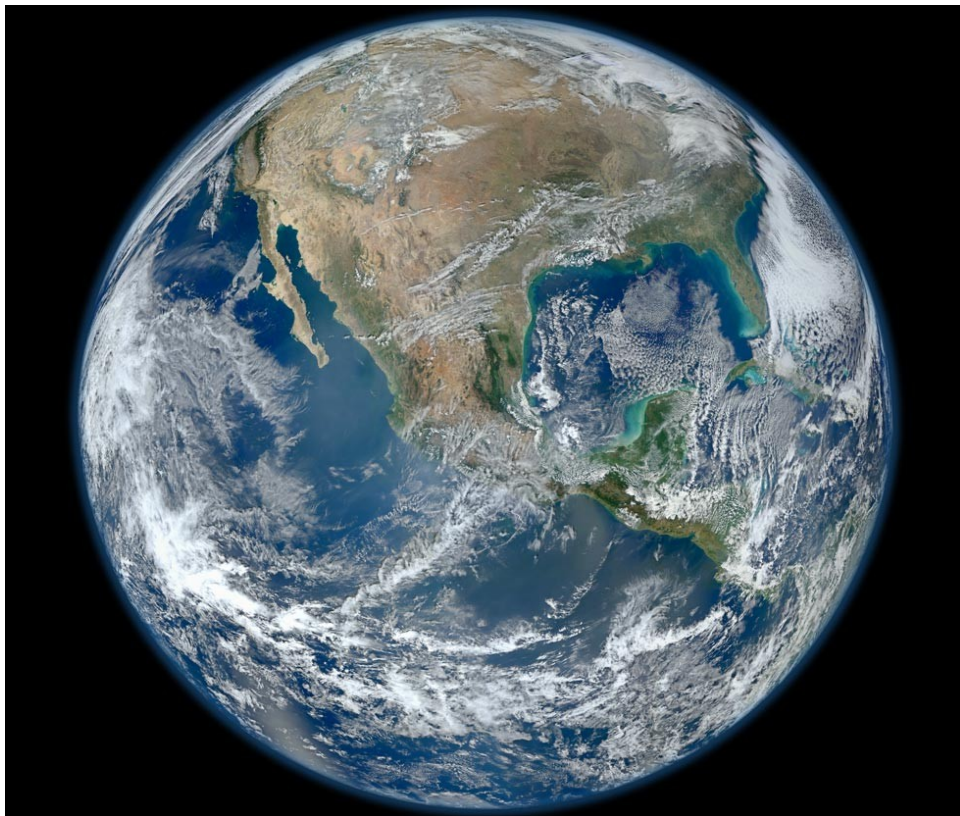
Blue Marble Earth. NASA's " Astronomy Image of the Day " for January 30, 2012.