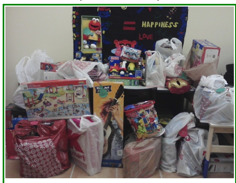
Fruits of the Angel Tree drive

Thank you to all who gave generously to the Angel Tree drive benefiting underprivileged children through the "Adopt A Wish" program of ChildNet. We had 100% participation this year which meant that every child had their holiday wishes come true because of you.