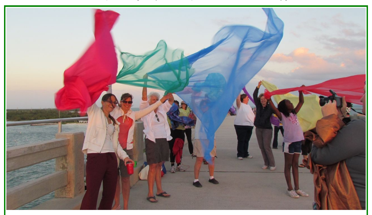
The Full Moon Daughters scarf dance at sunset on the old railroad bridge at Bahia Honda State Park, in the Florida Keys.

ant to make a big impression on everyone else in the campground? Try scarf dancing on a bridge in the beautiful Florida Keys at sunset. The Full Moon Daughters did exactly that during this year's camping trip to Bahia Honda State Park on November 11-13, extending a sunset tradition started last year. We had a record Bahia Honda attendance of 24 women and girls, who slept under the stars (well, a couple stayed in hotels) in one of Florida's most lovely parks.