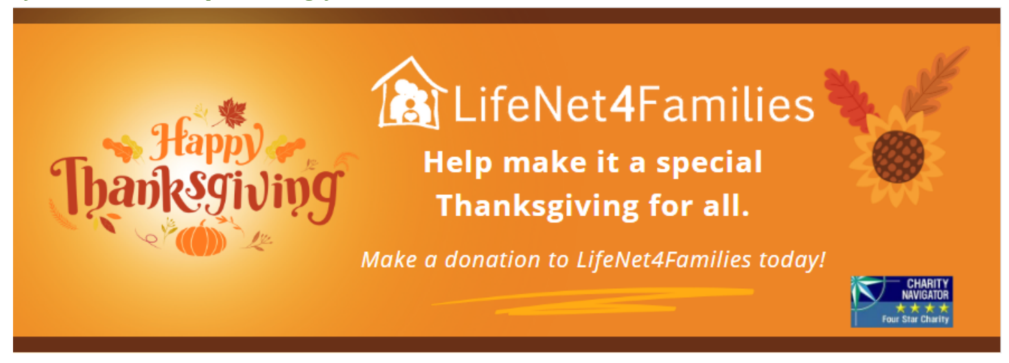
LifeNet4Families - Help Feed Hungry Families

As Thanksgiving approaches, we are filled with appreciation for the blessings and abundance in our lives. But it's also a time to reflect on those who are less fortunate and need a helping hand.