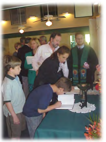
Happy 24th Birthday, River of Grass! February 2023